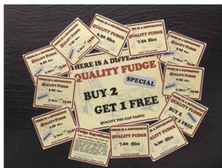
Laminated Price Sign Set PSET-EN / PSET-FR LAM - PRICE - EN / FR