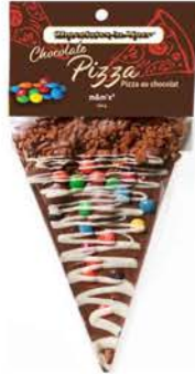
TOPPED WITH CP2 M&M's®