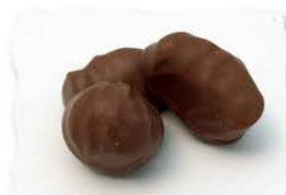
CMB6 Bulk 4 lb case