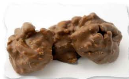
CCLB7 Bulk 3 lb case