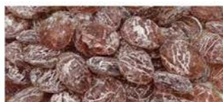
H7 BUTTERSCOTCH Light Brown - Drops