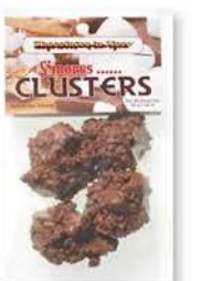
CCLP11 90g/pkg 24 bags/case