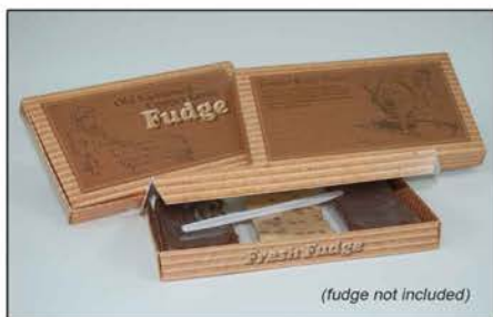
3 Slice Fudge Box Dimensions: 9 3/8" x 5 1/2" x 1 1/16" FBOX