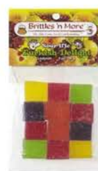
TDP4 SOUR-IFIC Sour Lemon, Sour Raspberry, Sour Lime, Sour Grape, Sour Orange, Sour Cherry