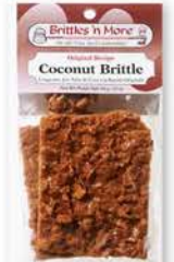
BR17 150g/pkg 24 bags/case MSRP $5.99-$7.49