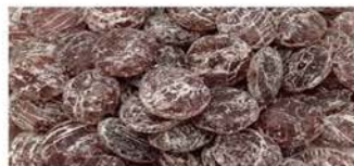
H1 HUMBUGS Brown - Drops

Flavours are sold in 5lb increments and you can mix and match up to 4 flavours per case to equal a full case.