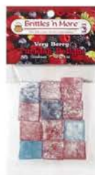
TDP3 VERY BERRY Raspberry, Cherry, Blueberry, Blackberry, Strawberry