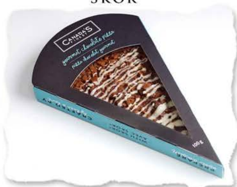
CP1B 100g/pkg 30 slices/case MSRP $6.99-$7.99