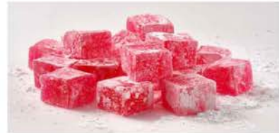
TD36 BUBBLEGUM (Pink)