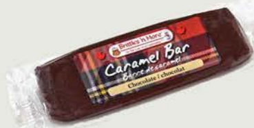
CAR 7 CHOCOLATE