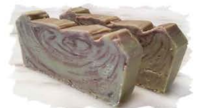
F65 MINT CHOCOLATE RIPPLE A refreshing mint flavoured fudge with belgian milk chocolate