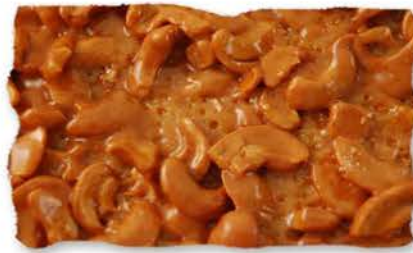
BR13 Bulk 10 lb case