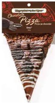
TOPPED WITH CP8 OREO®