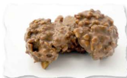
CCLB12 Bulk 3 lb case