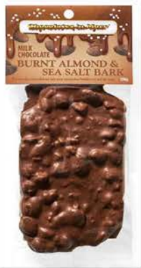
CB1 MILK CHOC. BURNT ALMOND & SEA SALT