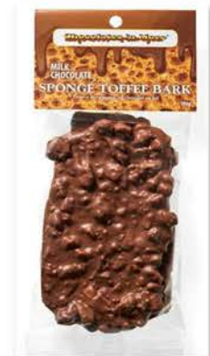
CB8 SPONGE TOFFEE