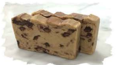
F58 COOKIE DOUGH Creamy, insanely delicious cookie batter with milk chocolate chunks