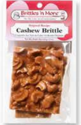
BR12 150g/pkg 24 bags/case MSRP $7.99-$8.75