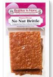
BR45 150g/pkg 24 bags/case MSRP $6.49-$7.49