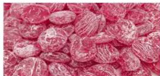
H2 CHERRY Red - Drops