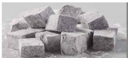
TD7 GRAPE (Purple)

Flavours are sold in 5lb increments and you can mix and match up to 4 flavours per case to equal a full case.