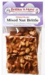
BR23 150g/pkg 24 bags/case MSRP $6.99-$7.99