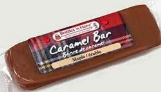
CAR 6 MAPLE