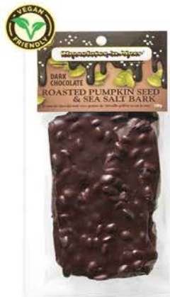
CB7 DARK CHOC. ROASTED PUMPKIN SEED & SEA SALT