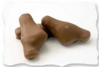
CMB1 Bulk 4 lb case