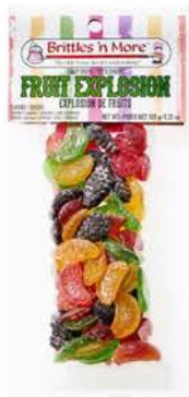
HP1 FRUIT EXPLOSION

A mix of Orange, Lemon, Lime, Cherry, Grape