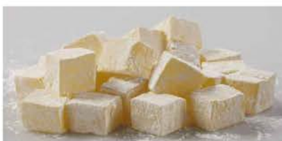
TD20 LEMON (Yellow)