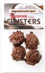
CCLP4 90g/pkg 24 bags/case