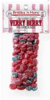
HP2 VERY BERRY

A mix of Orange, Lemon, Lime, Cherry, Grape