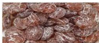
H14 ROOTBEER Brown - Drops