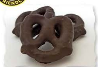
CMB9 Bulk 2.5 lb case