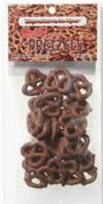
CMP8 90g/pkg 24 bags/case