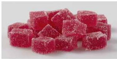
TD29 SOUR RASPBERRY (Red)