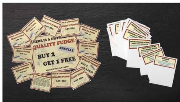
Laminated Full Set Flavour & Pricing Signs FSET - EN / FR