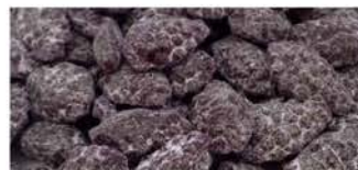
H12 GRAPE Purple - Grape Shape