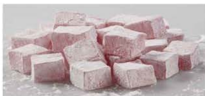
TD1 RASPBERRY (Red)