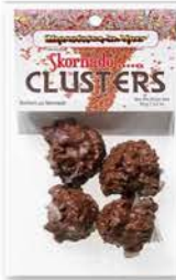
CCLP10 90g/pkg 24 bags/case