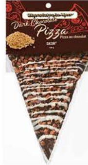
DARK CHOCOLATE TOPPED WITH CP9 SKORS®