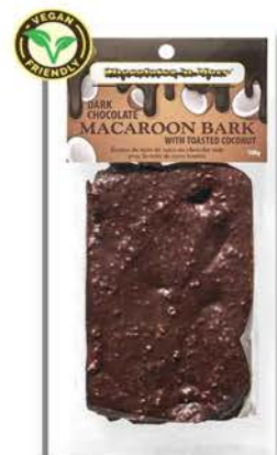
CB4 DARK CHOC MACAROON