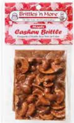
BR41 150g/pkg 24 bags/case MSRP $7.49-$8.99