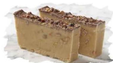
F53 REESES PIECES Our smooth peanut butter fudge with Reese's Pieces