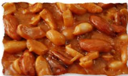
BR24 Bulk 10 lb case