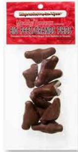
CMP1 90g/pkg 24 bags/case