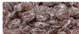
H16 COLA Brown - Drops