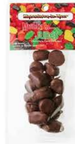
CMP6 120g/pkg 24 bags/case