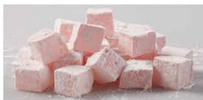
TD22 WATERMELON (Light Pink)