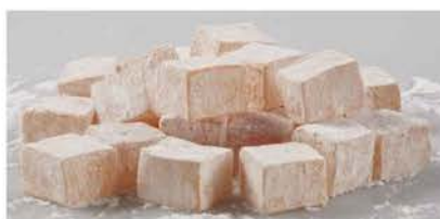
TD27 MANGO (Light Orange)