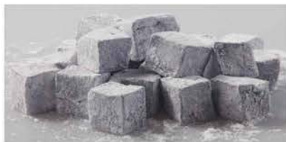
TD24 BLACKBERRY (Dark Purple)