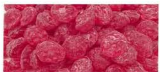
H6 RASPBERRY Red Berry - Drops