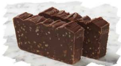
F43 CHOCOLATE PEANUT BUTTER CRUNCH Chocolate, peanut butter & peanuts. Smooth and crunchy!