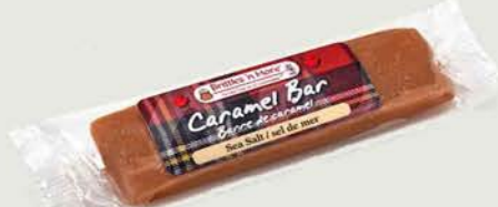
CAR 9 SEA SALT