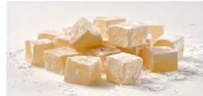
TD37 CREAM SODA (Clear)