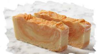
F45 CREMESICLE SWIRL Vanilla fudge with an orange swirl & natural orange flavouring