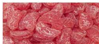
H8 ORANGE Orange - Slices