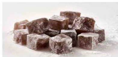
TD38 ROOTBEER (Brown)