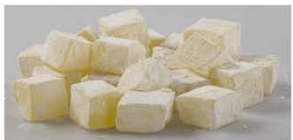
TD23 BANANA (Yellow)