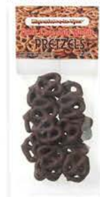
CMP9 90g/pkg 24 bags/case