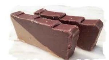
F67 CHOCOLATE MAPLE Our top sellers combined. The best of both worlds