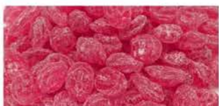
H11 STRAWBERRY Light Red - Berry Drops