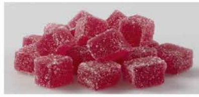
TD30 SOUR CHERRY (Red)