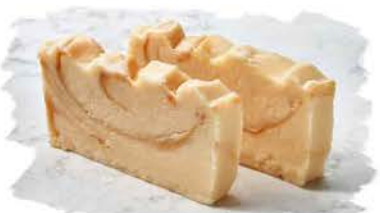
F64 CARAMEL APPLE Our handmade caramel in an apple flavoured fudge. For the child in everyone