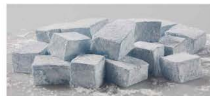
TD19 BLUEBERRY (Blue)