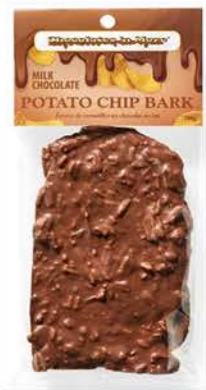
CB5 POTATO CHIP