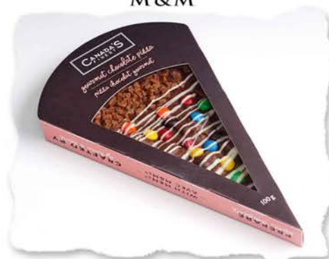
CP2B 100g/pkg 30 slices/case MSRP $6.99-$7.99