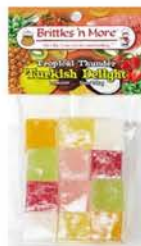
TDP2 TROPICAL THUNDER Mango, Pineapple, Coconut, Kiwi, Watermelon, Strawberry