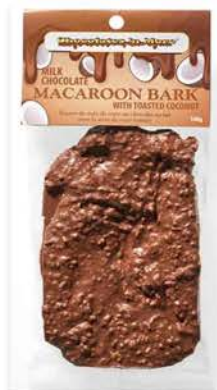
CB3 MILK CHOC MACAROON