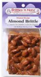
BR10 150g/pkg 24 bags/case MSRP $8.49-$9.25