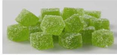
TD33 SOUR LIME (Green)