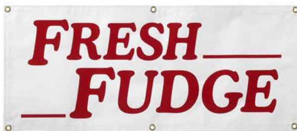
Fresh Fudge banner (English) Dimensions: 36" x 15" BAN-EN