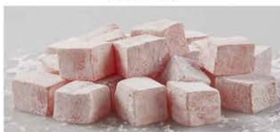
TD9 PEACH (Light Orange)