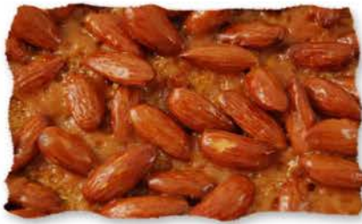
BR11 Bulk 10 lb case