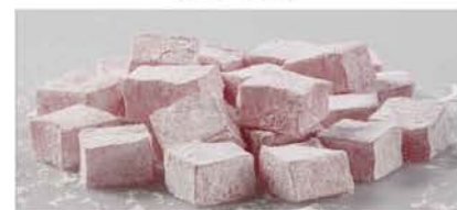
TD5 STRAWBERRY (Red)