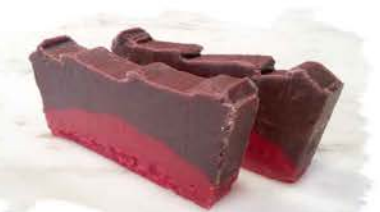
F69 CHOCOLATE RASPBERRY Our chocolate fudge combined with raspberry fudge.