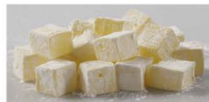
TD28 PINEAPPLE (Yellow)