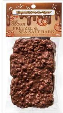
CB6 PRETZEL & SEA SALT