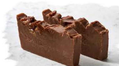
F74 SALTED CHOCOLATE CARAMEL Chocolate fudge with sea salt and a caramel ribbon throughout!