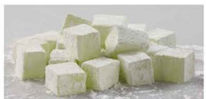
TD26 KIWI (Light Green)