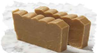
F56 PENUCHE The original fudge. Made from brown sugar. The flavour is reminiscent of caramel.