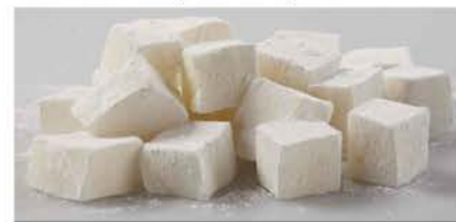
TD25 COCONUT (White)