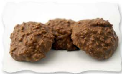
CCLB4 Bulk 3 lb case