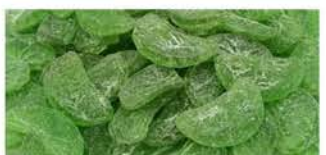
H10 LIME Green - Slices