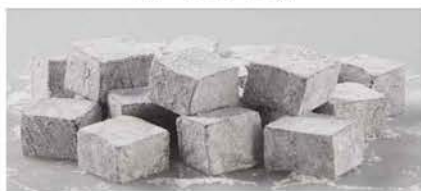
TD17 LICORICE (Black)