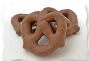
CMB8 Bulk 2.5 lb case