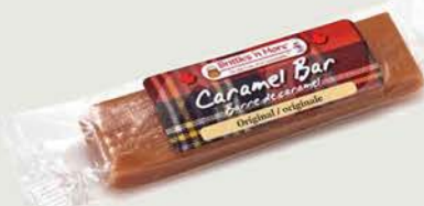
CAR 2 REGULAR