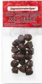
CMP7 90g/pkg 24 bags/case