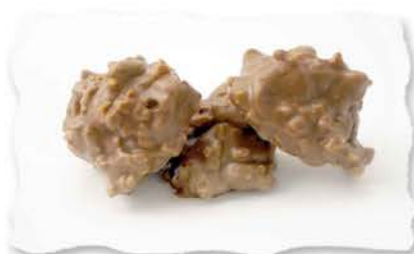
CCLB10 Bulk 3 lb case