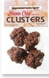
CCLP6 90g/pkg 24 bags/case