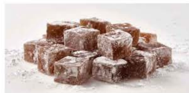
TD39 MAPLE (Light Brown)