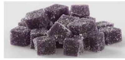
TD31 SOUR GRAPE (Purple)