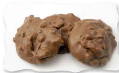
CCLB5 Bulk 3 lb case