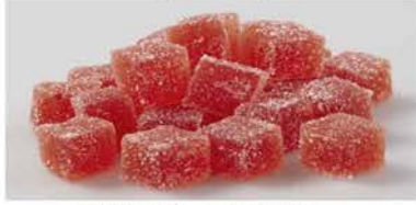
TD32 SOUR ORANGE (Orange)