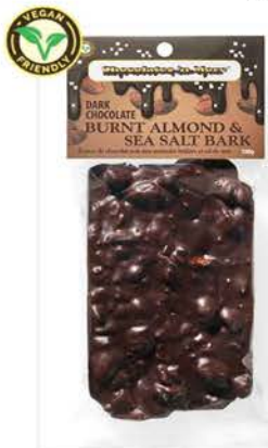
CB2 DARK CHOC. BURNT ALMOND & SEA SALT