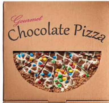
TOPPED WITH CPW2 M&M's®