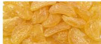
H9 LEMON Yellow - Slices