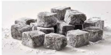
TD35 COLA (Dark Brown)