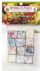
TDP1 FRUIT EXPLOSION Banana, Peach, Grape, Blueberry, Blackberry, Strawberry

24 bags/case 150g bag MSRP $5.49-$6.49 No extra charge for split cases