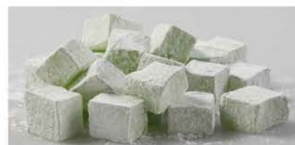
TD15 LIME (Green)