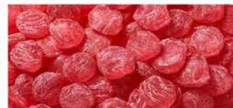
H17 BUBBLEGUM Pink