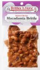
BR21 150g/pkg 24 bags/case MSRP $12.99-$13.75