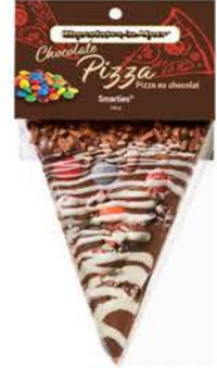
TOPPED WITH CP5 SMARTIES®