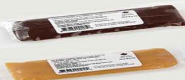
Back Label View Flavour, Weight, Ingredients, Barcode (lot code & best before sticker)