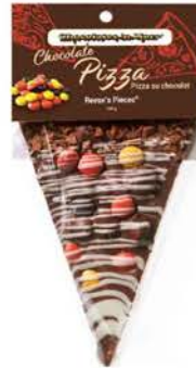
TOPPED WITH CP4 REESE'S PIECES®