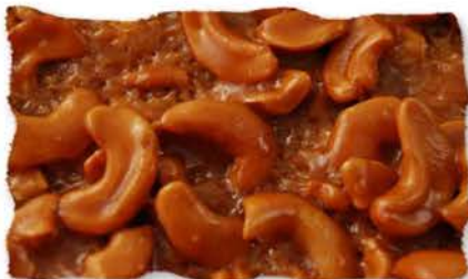
BR40 Bulk 10 lb case