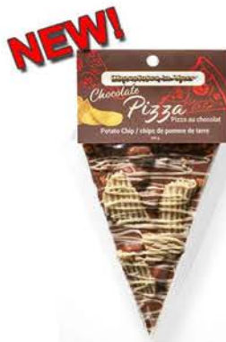
CP12 POTATO CHIP