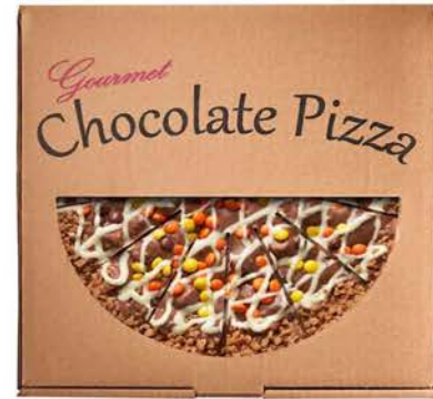
TOPPED WITH CPW4 REESE'S PIECES®