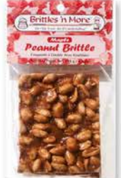
BR43 175g/pkg 24 bags/case MSRP $6.99-$7.99