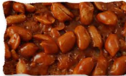
BR42 Bulk 10 lb case