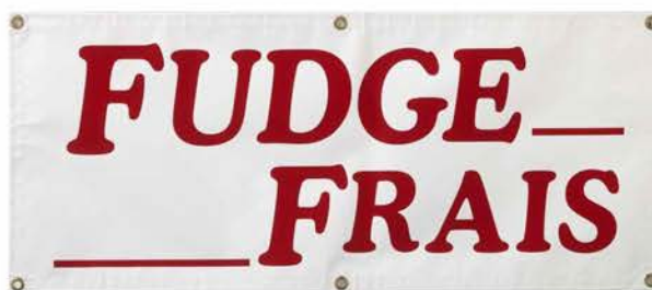
Fresh Fudge banner (French) Dimensions: 36" x 15" BAN-FR