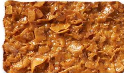
BR18 Bulk 10 lb case