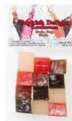
TDP5 SODA POP Cola, Cream Soda, Rootbeer, Orange