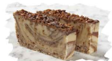
F55 SKORNADO Our popular vanilla fudge with a chocolate swirl, a splash of toffee flavour and crunchy Skor bits