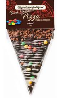
DARK CHOCOLATE TOPPED WITH CP10 M&M's®