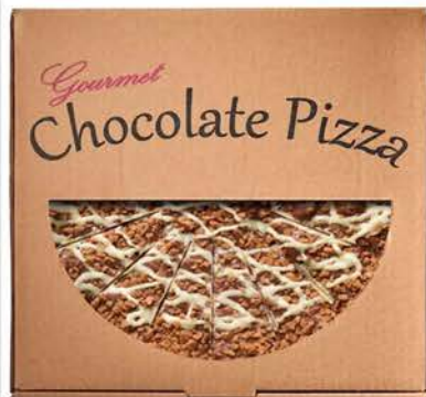
TOPPED WITH CPW1 SKORS®

Chocolate Pizzas are 750g and fit in a 12" pizza box. You can mix and match up to 4 flavours per case to equal a full case. 4 whole pizzas/case MSRP $45.00-$50.00