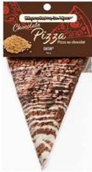
TOPPED WITH CP1 SKORS®

These products are made with Belgian Couverture Milk and Dark Chocolate for an incredibly smooth experience. Our slices are made with a base of Chocolate combined with sponge toffee pieces and marshmallows (no peanuts are used in the base). The "crust" of the slice is garnished with skor bits. We use various candy toppings to decorate the different varieties of Chocolate Pizza