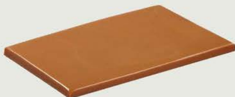
CAR 1 APPROX 5LB SLAB