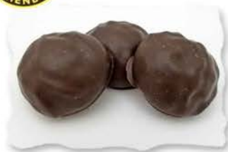
CMB7 Bulk 4 lb case