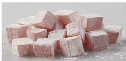
TD11 ORANGE (Orange)