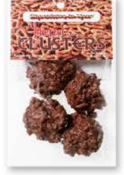
CCLP7 90g/pkg 24 bags/case