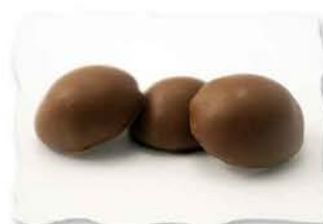
CMB3 Bulk 4 lb case