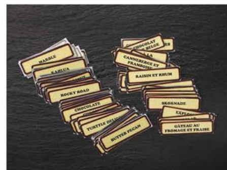
Laminated Mini Labels MINI-EN / MINI-FR MINI - SS - EN / FR