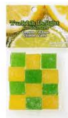
TDP7 LEMON LIME