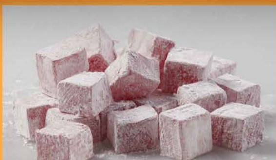
Raspberry Turkish Delight