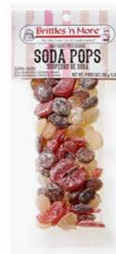
HP8 SODA POP

A mix of Cola, Cream Soda, Root Beer, Orange