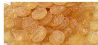
H5 MAPLE Light Brown - Drops