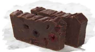
F44 BLACK FOREST Our popular double chocolate fudge combined with tasty cherries