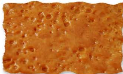
BR44 Bulk 10 lb case