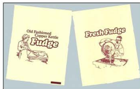
Fudge Bag Dimensions: 5" x 7" FBAG