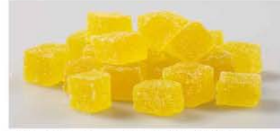
TD34 SOUR LEMON (Yellow)