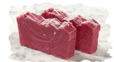
F48 STRAWBERRY CHEESECAKE A great combination of strawberry & cheesecake flavouring. Yummy!