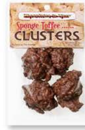
CCLP12 90g/pkg 24 bags/case