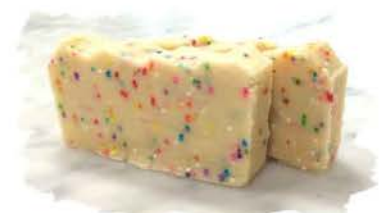
F54 BIRTHDAY CAKE Colourful sprinkles in our creamy fudge. Tastes like a cupcake at a birthday party!