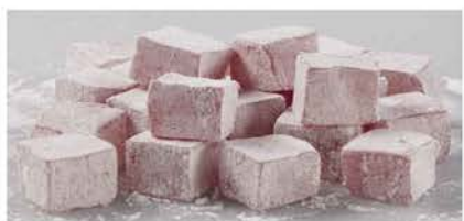
TD3 CHERRY (Red)