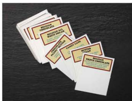
Laminated Flavour Signs REGSET - E / F REG - SS - E / F