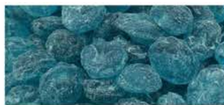
H4 BLUEBERRY Blue - Berry Drops