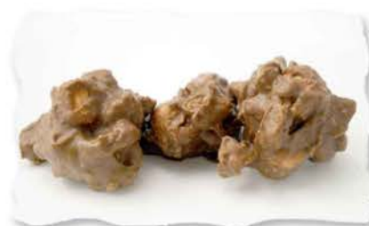
CCLB11 Bulk 3 lb case