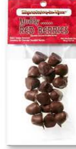
CMP3 90g/pkg 24 bags/case