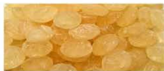
H15 CREAM SODA Clear - Drops