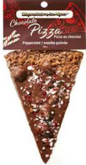
CP6 PEPPERMINT Available (Oct 1 - Nov 30)