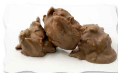
CCLB6 Bulk 3 lb case