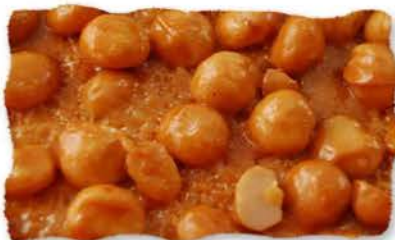
BR22 Bulk 10 lb case