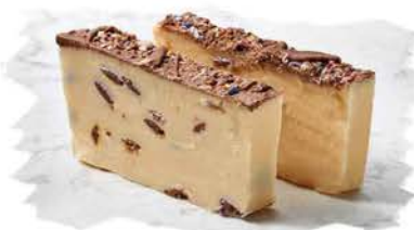
F57 SMARTTEES Our popular vanilla fudge with Smarties. Mmmmm good!